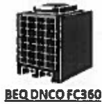
BEQ DNCO FC360